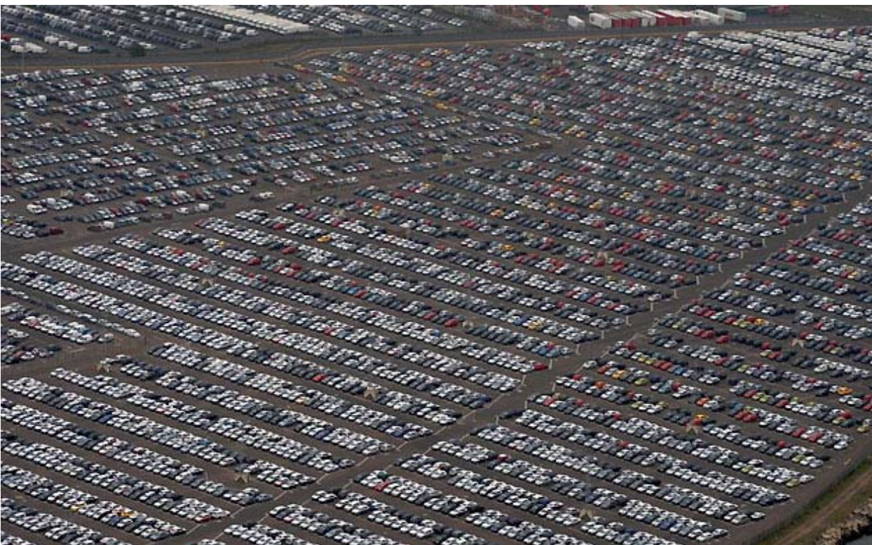
Imported cars stored at Sheerness open storage area awaiting delivery to dealers