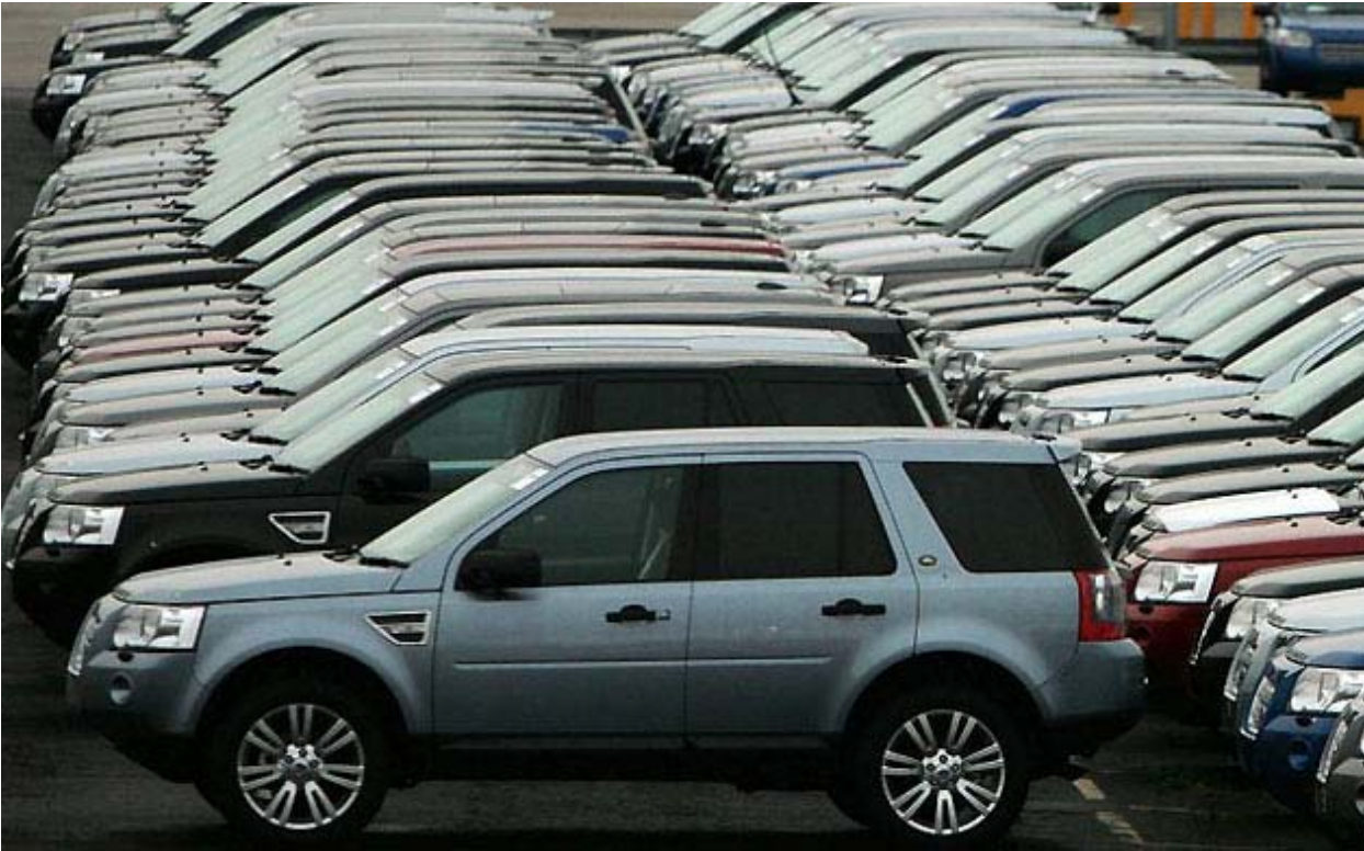
Land Rover Freelander cars await distribution outside the Halewood operations site in Liverpool