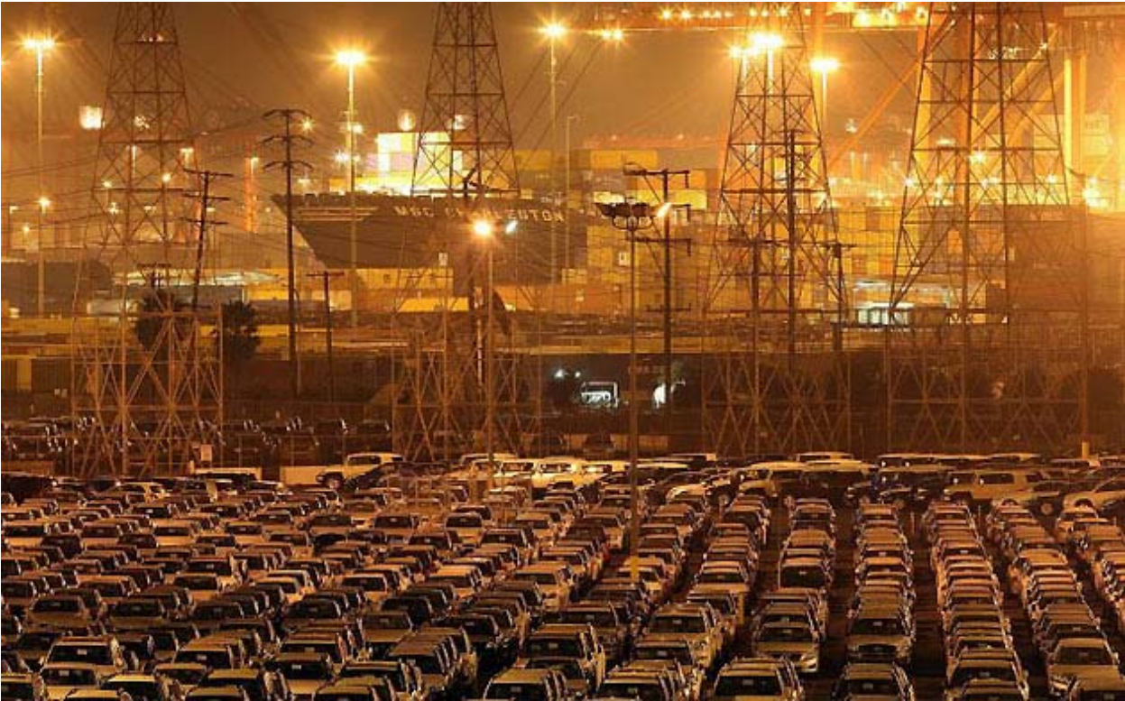
Newly imported cars fill the 150-acre site at the Toyota distribution centre in Long Beach, California