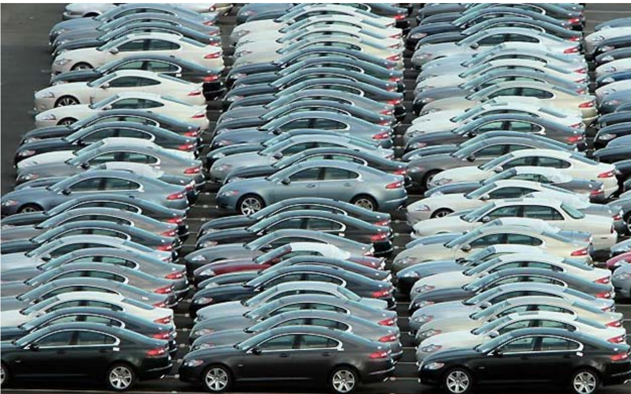
Earlier this week Jaguar Land Rover said 450 British jobs would go