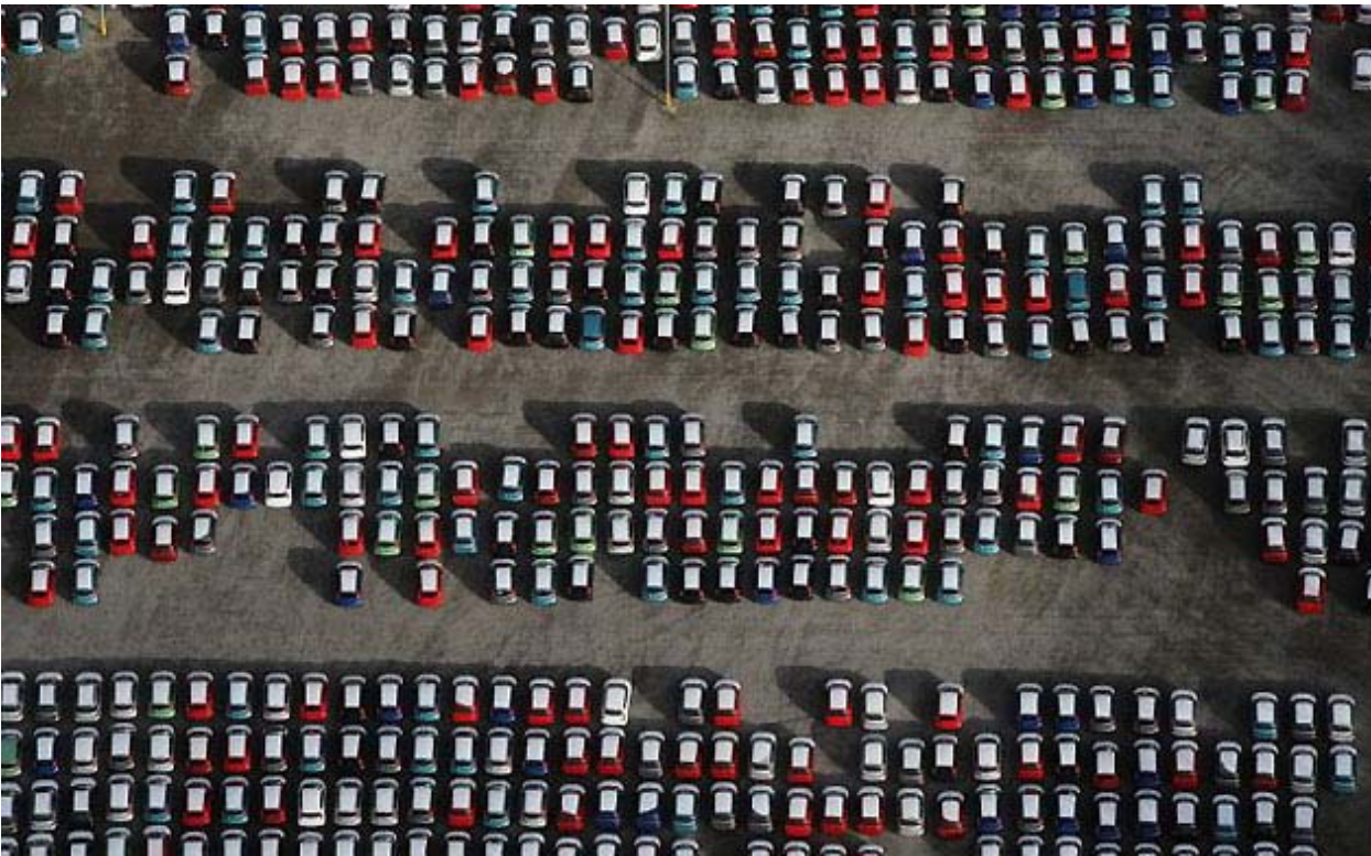
Unsold cars at Avonmouth Docks near Bristol