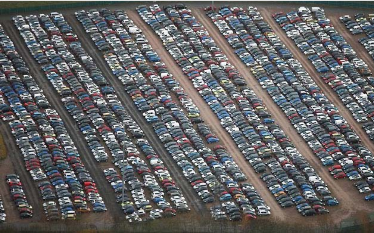
The open car storage areas in Corby, Northamptonshire, are reaching full capacity