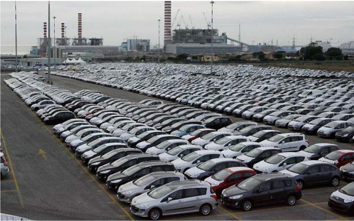
Peugeot cars await shipment to Italian dealers at the port of Civitavecchia