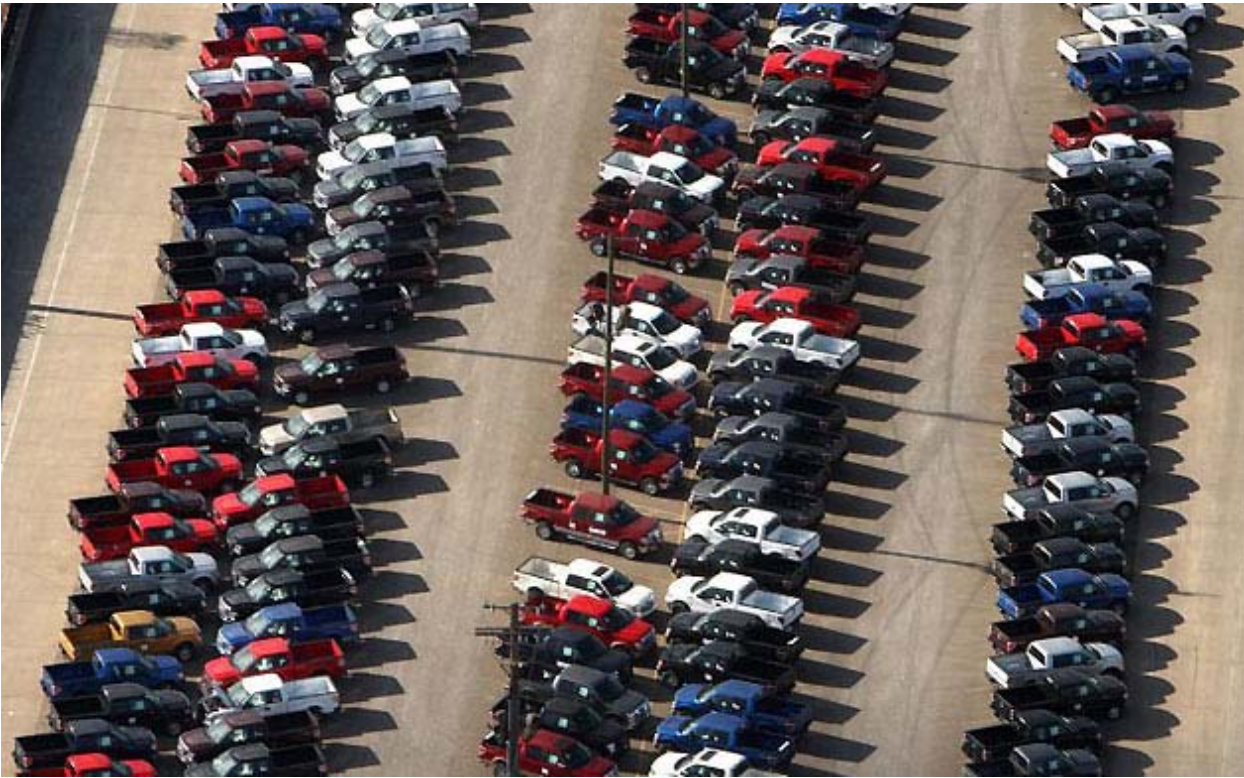
Stocks of Ford trucks in Detroit, Michigan