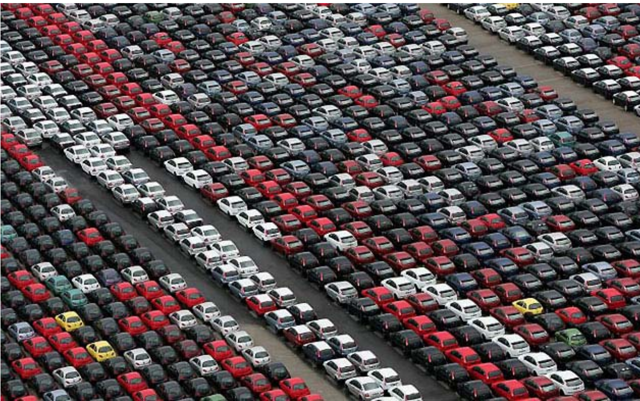
New cars jam the dockside in the port of Valencia in Spain